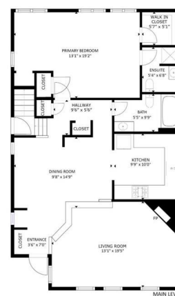
12 Big Springs Crescent - Airdrie MAIN LEVEL: 1090.5 SqFt SIZES AND DIMENSIONS ARE APPROXIMATE, ACTUAL MAY VARY.