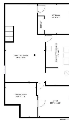
12 Big Springs Crescent - Airdrie BASEMENT: 1090.51 SqFt SIZES AND DIMENSIONS ARE APPROXIMATE, ACTUAL MAY VARY.