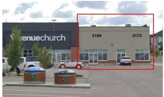
Floor Plan 3169 & 3173 2920 Kingsview Blvd